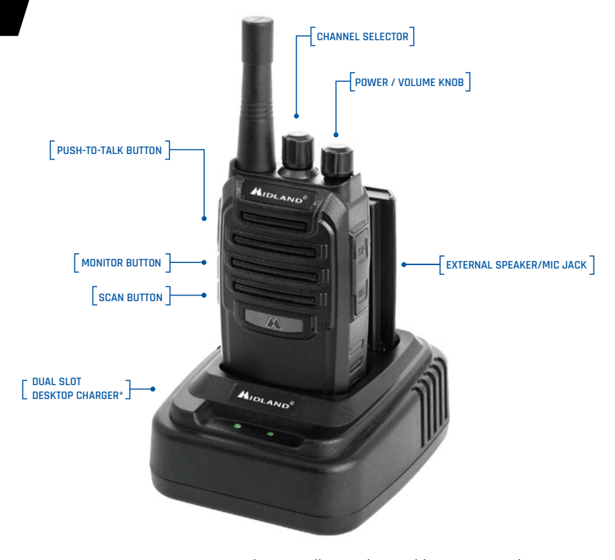
WHAT'S IN THE BOX: Business Radio • Rechargeable Battery Pack Belt Clip • Desktop Charger • AC Wall Adapter • Owner's Manual.